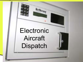
Electronic Aircraft Dispatch