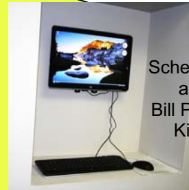
Scheduling and Bill Paying Kiosk