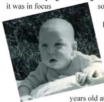
16 years old at the time.

My first memory of photography was sitting on my father's lap in the darkroom of the D. Peterson Photo Studio in Parsons, tray-processing prints. My first published photo was of a parade with a marcher carrying a U.S. flag. It was probably not much of a photo, but, a 6-year-old had shot it and it was in focus so that must have made it worthy.