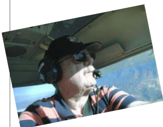
Lifetime Achievement award from the PPAGLA!